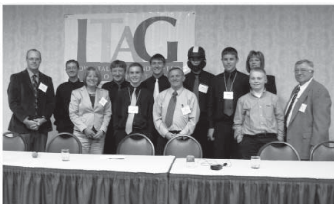
Students, teachers, business partners, and administrators relax after their keynote presentation, Stepping into the Future of Teaching and Learning with Virtual Reality Education Pathfinders .