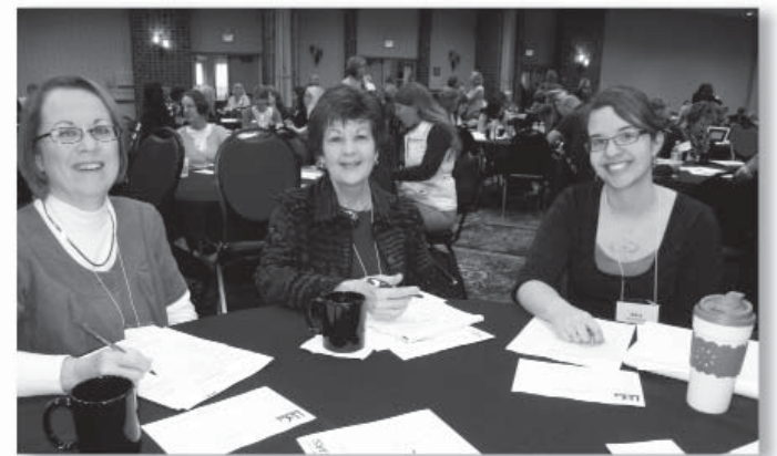
Attendees are all smiles as they prepare for Tuesday's keynote presentation.