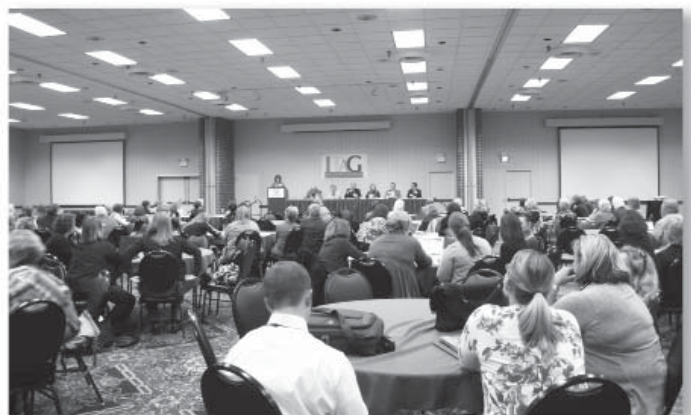
Some of over 400 conference attendees listen to a panel discussion.