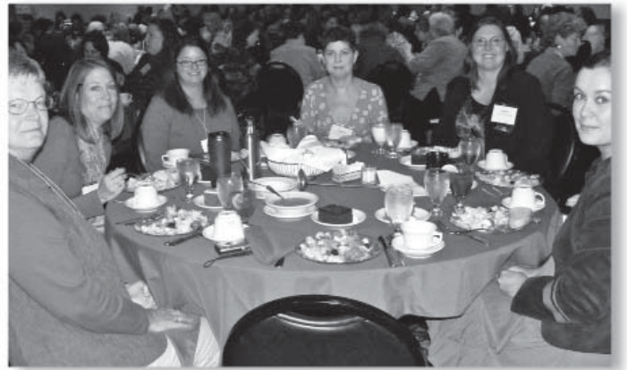
Parents of gifted students convene with board members over lunch.